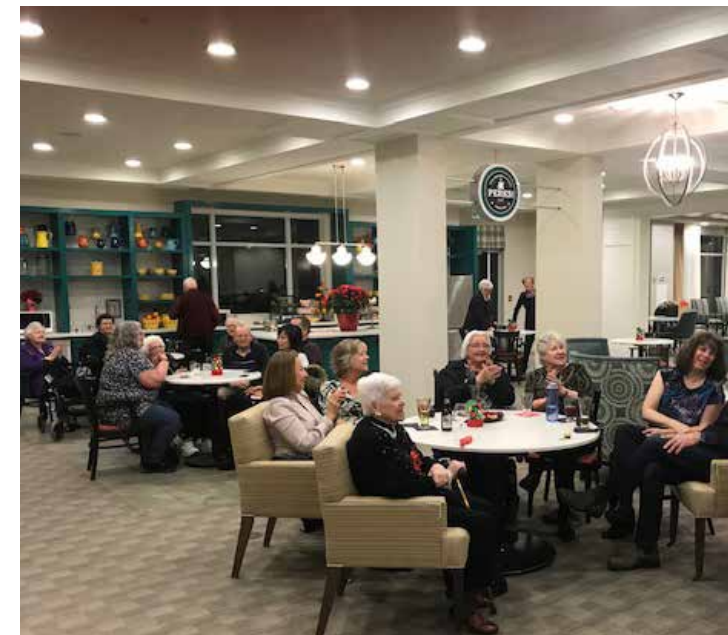
Spreading holiday cheer.