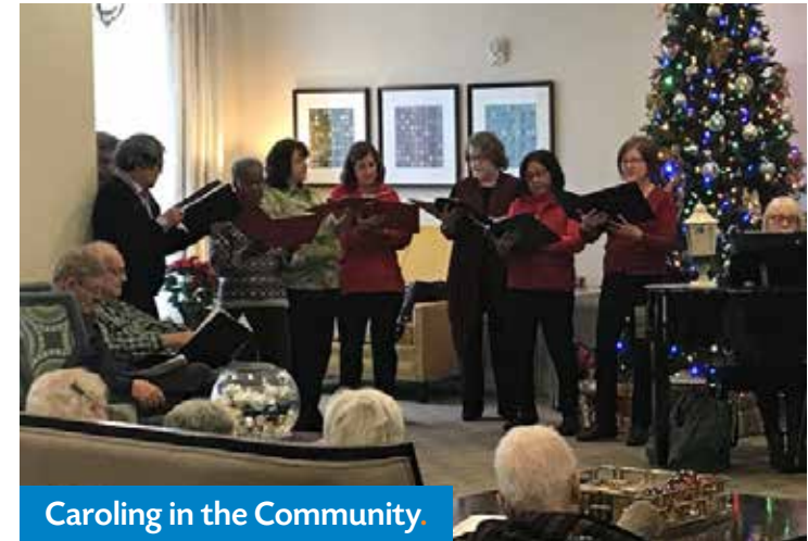
Caroling in the Community.

Over 200 Community Members, their families, and guests enjoyed a festive VIVALicious meal at VIVA Barrhaven's second annual Family Christmas Dinner. Music flowed throughout the Community from our harpist player. It was a great way to start the holiday season, and had our Community Members buzzing about it for days.