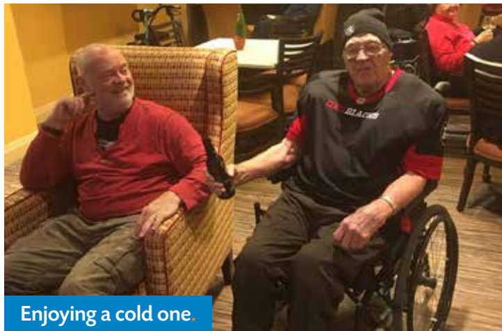
Enjoying a cold one.