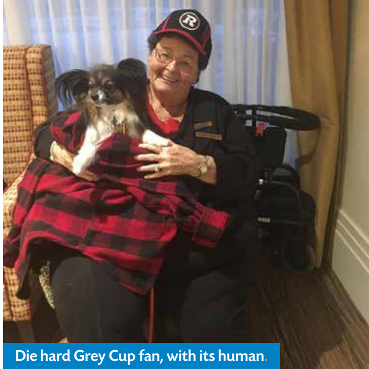
Die hard Grey Cup fan, with its human.

In late November, the residents at VIVA Barrhaven celebrated the Grey Cup and showed their team spirit, by wearing red and black to a Grey Cup party in Mel's Barr. Prizes were awarded for the Community Member with the most spirited outfit.