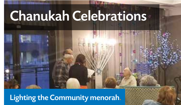
Lighting the Community menorah