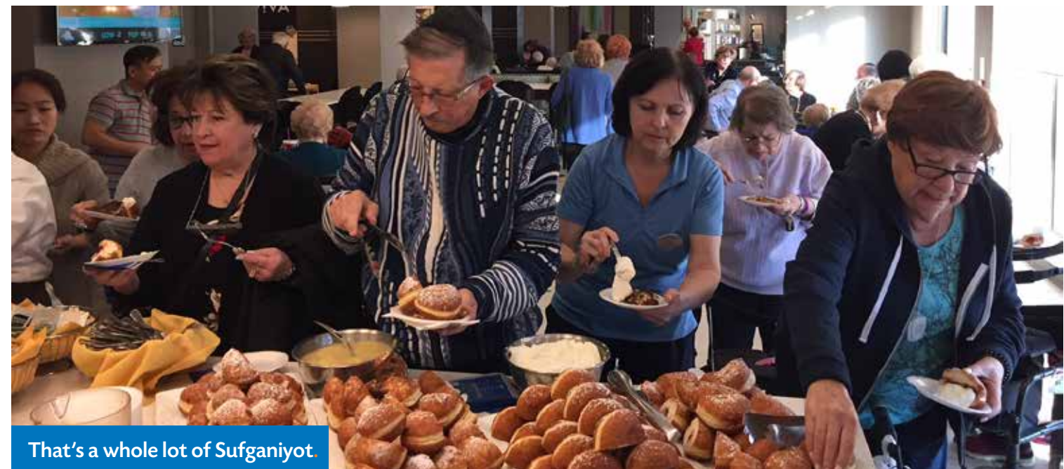
That's a whole lot of Sufganiyot.