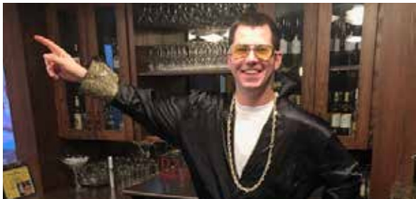
The “King” of serving drinks.