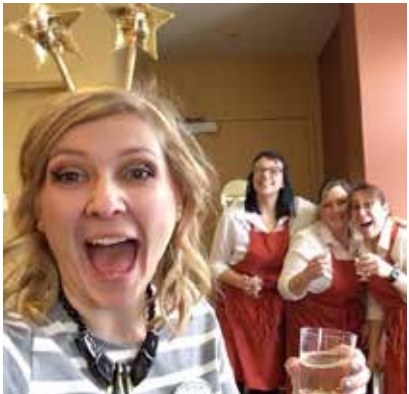
Team Member selfie.