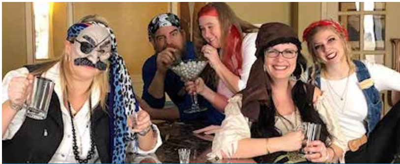
Shiver me timbers! We be tending the ale at the pub!