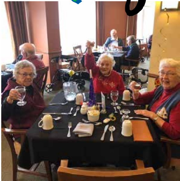
Cheers to the New Year.