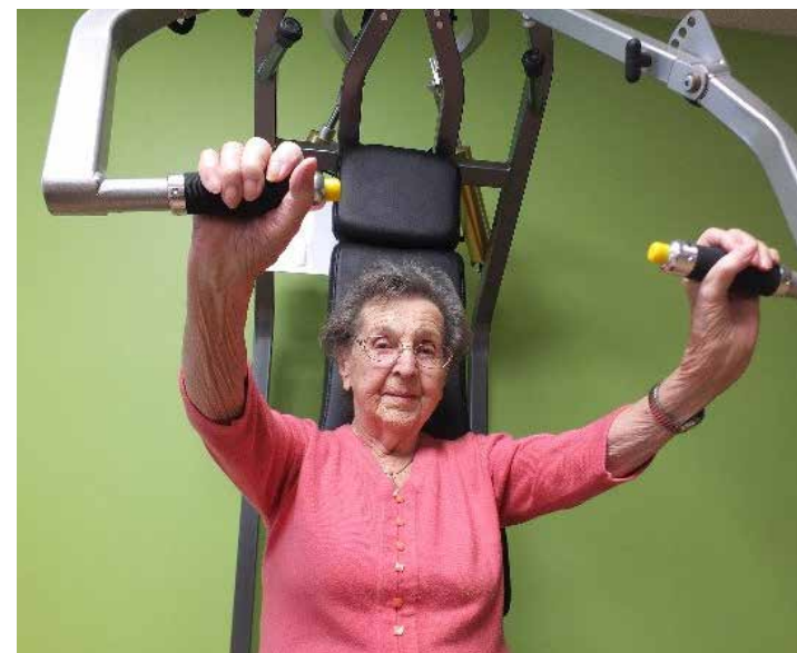
No pain no gain.