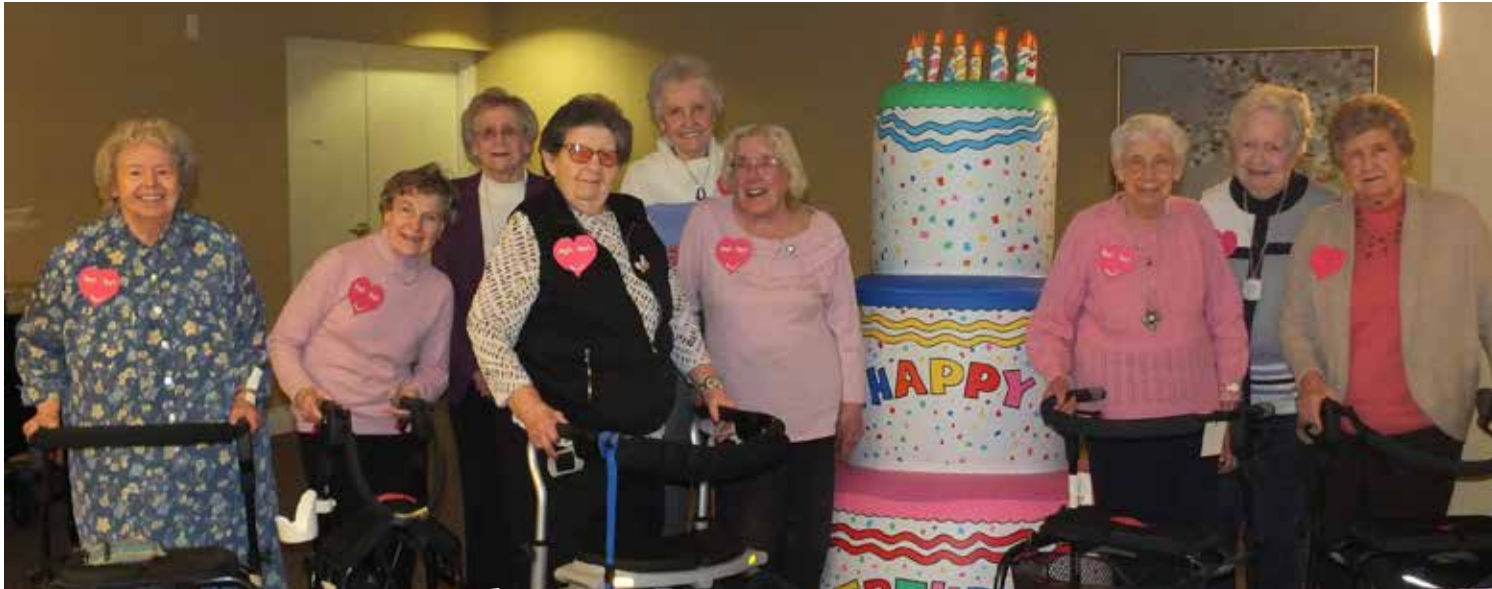
February Birthday's wearing their hearts on their sleeves.