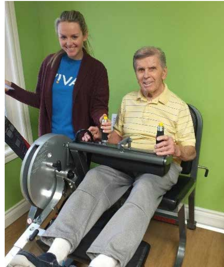
Keeping fit and having FUN.

Time to head back to the gym! If you've never tried it, what are you waiting for? Do as much or a little as you want, but the important thing is to do SOMETHING. Whether it is using the strength equipment to keep your legs and arms strong or the Group Fitness classes – the "Use It or Lose It" should be a great motivator. We in Lifestyles always say, "a little bit of something is better than a whole lot of nothing!" Be sure to check out our Gym 'OPEN DOORS' April 2nd. Time to put your fears and excuses to rest!