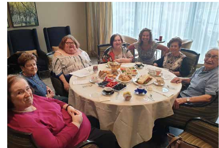
Friend in High (Tea) places.

I watched the staff in preparation, In an attempt to create civilization, With high tea served in a China cup, While drinking keep your pinkie up, And please do not slurp your tea, Show how refined we can be, The conversation should not be too loud, If you do not want to be escorted out, Many thanks to the creators of this feat, Those are the people you want to meet.