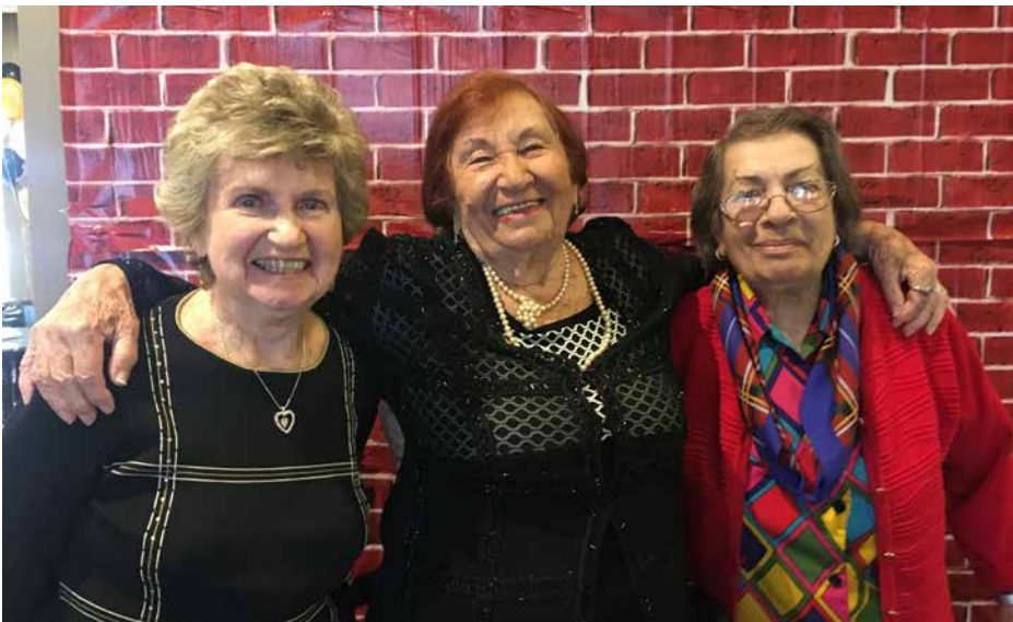
Posing during a party.