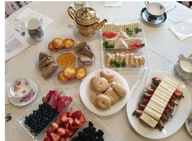
Delicious spread for High Tea.

Welcome to May! There was a lot of activity in our Community this past month! From High Tea to Arts and Crafts, there was a lot to see and do. Check it out!