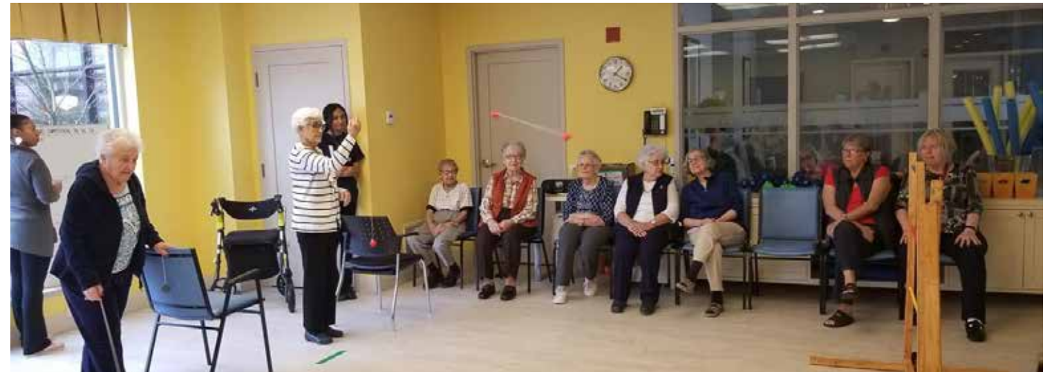
Ready to beat and defeat our visiting opponents.