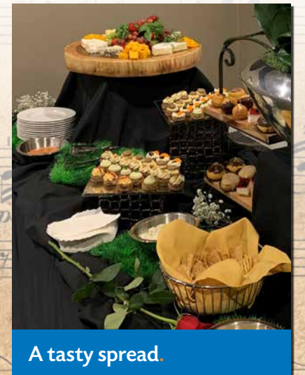
A tasty spread.