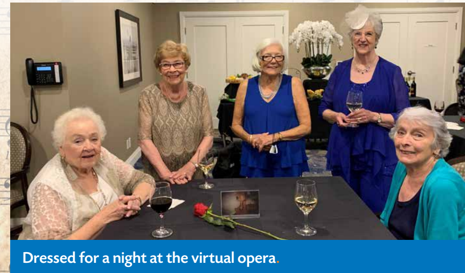
Dressed for a night at the virtual opera.

Our Community Members were deeply moved by the music; Maurice Ravel's famous Boléro, Georges Bizet's Carmen Suite No. 1, Joaquin Rodrigo's famous Concierto de Aranjuez, and more Latin American pieces.