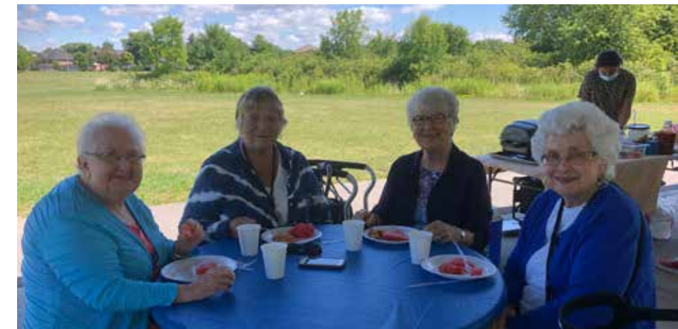
Soaking up the summer days with friends at Rotary Park.

We've all been enjoying the beautiful summer weather, and what better way to get some sunshine than having a BBQ in the park? We made our way over to Rotary Park in Ajax, where Community Members enjoyed freshly grilled hamburgers and hotdogs, great music, fun games, and good company.