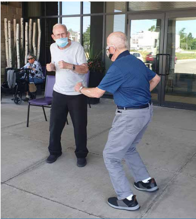
Dancing "The Twist".