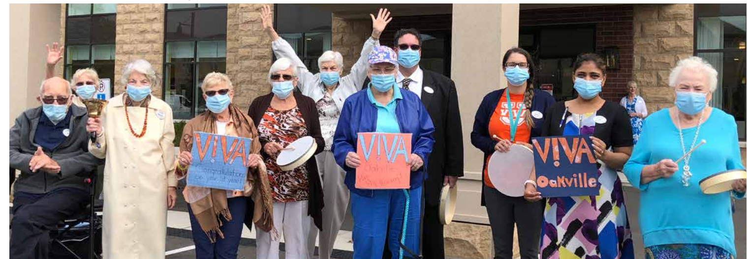
Community Members and Team members gather outside the Community building for a photo.