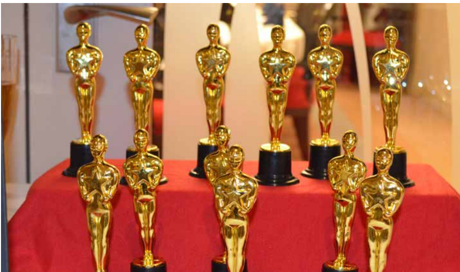
Festive decorations for a festive social.