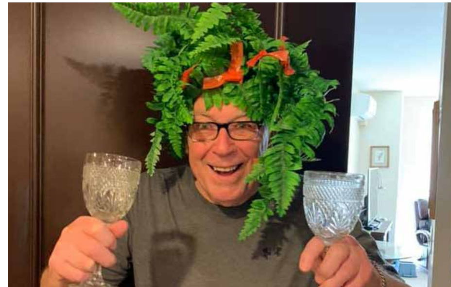
Our Crazy Hair Day Theme Cart had both Community Members and Team Members going wild.

COVID-19 UPDATE: Due to the ongoing pandemic, there is no events calendar at this time. Please speak with your Community's Lifestyles Team to learn more about what's happening at your Community this month!