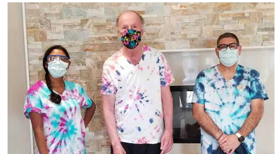
VIVA Pickering gets creative with their tie-dye t-shirt making. Don't we look groovy?