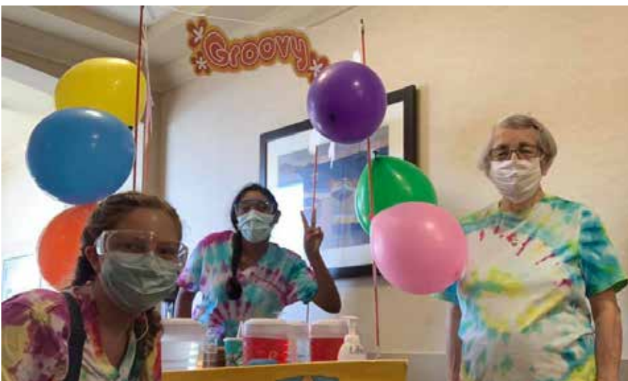
Everyone enjoys our Groovy Theme Cart loaded with fun treats and refreshments to go on around.