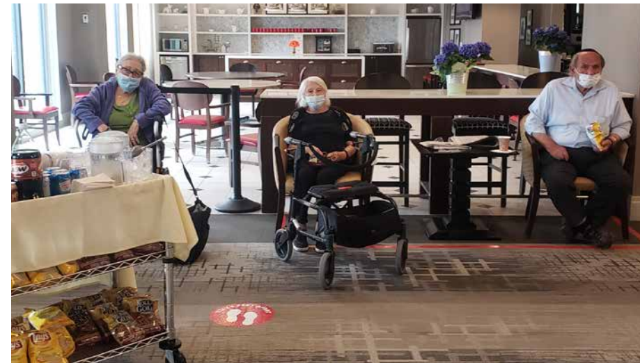
A specialty snack cart delivered tasty every Tuesday in April. Here are some Community Members enjoying chips and root beer.

COVID-19 UPDATE: Due to the ongoing pandemic, there is no events calendar at this time. Please speak with your Community's Lifestyles Team to learn more about what's happening at your Community this month!