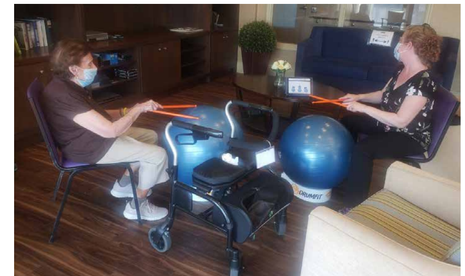
Enjoying a one-to-one VIVAfit DrumFit session.