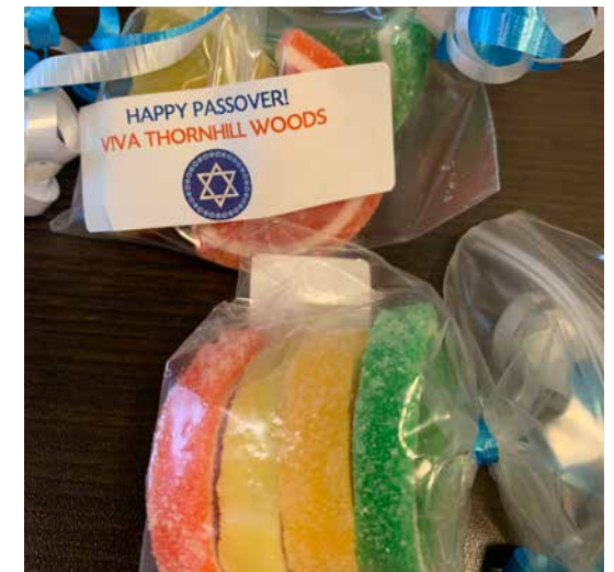
These tasty Passover treats were delivered to every suite.