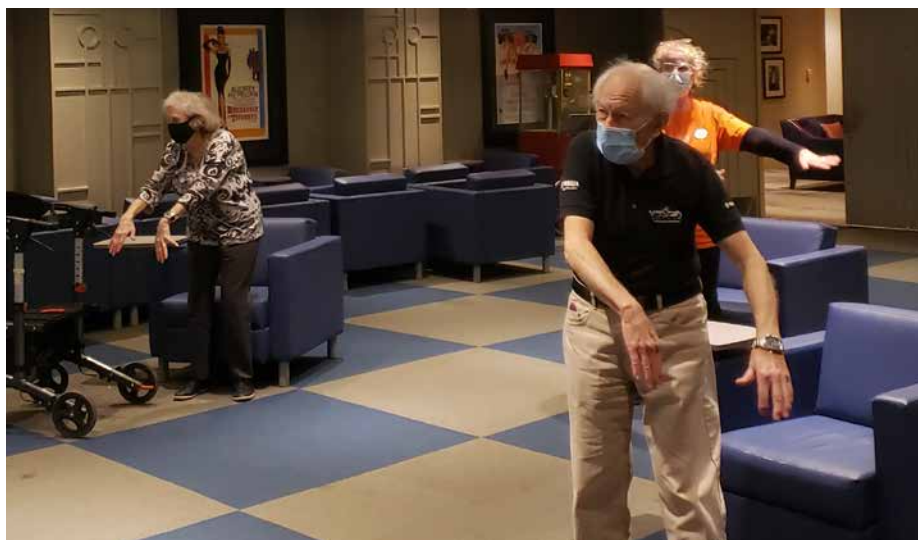
Community Members enjoying a dance-exercise class put on by the Canadian National Institute of Ballet.