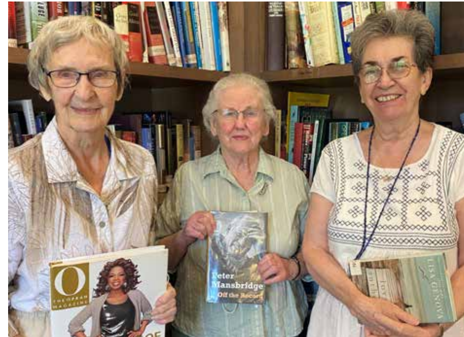
Book Club Community Members got together to talk about their weekly favourite reads.