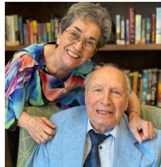
Celebrating 60 years of marriage.