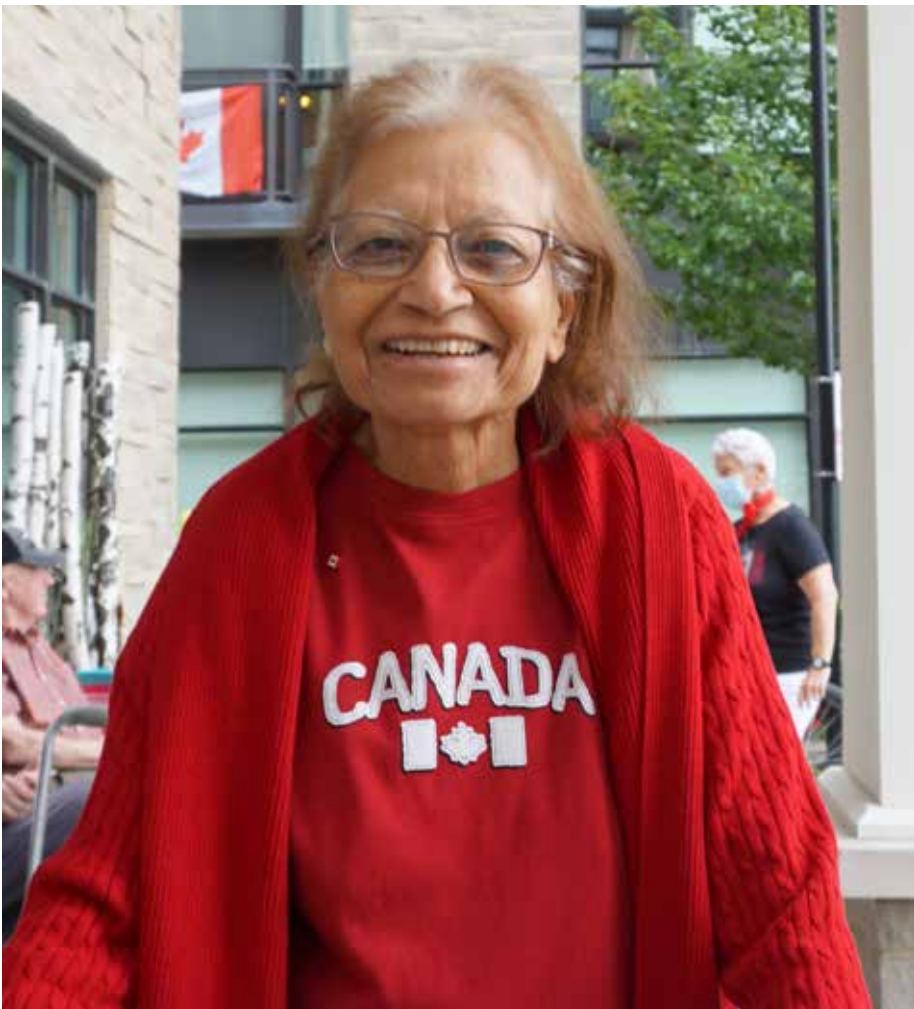
Canada Day celebrations had everyone outdoors and proudly wearing our flag colours.