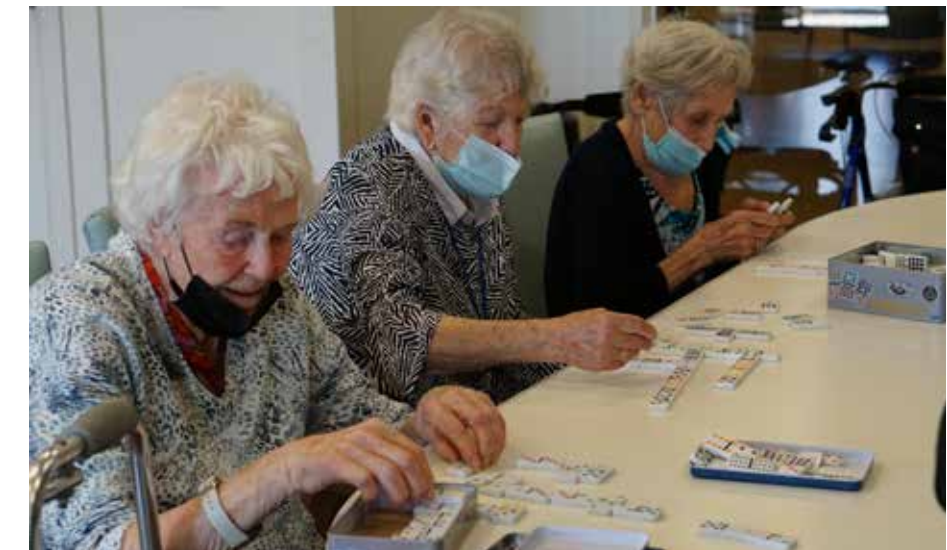
A game of Dominoes with friends.