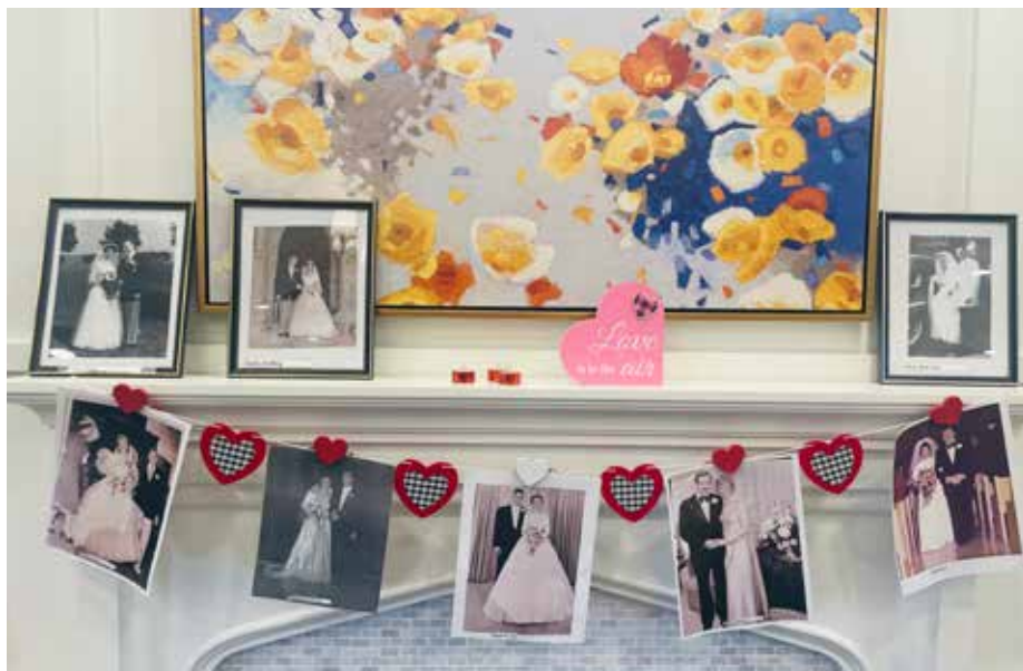
Taking a walk down memory lane as Community Members share their wedding pictures.