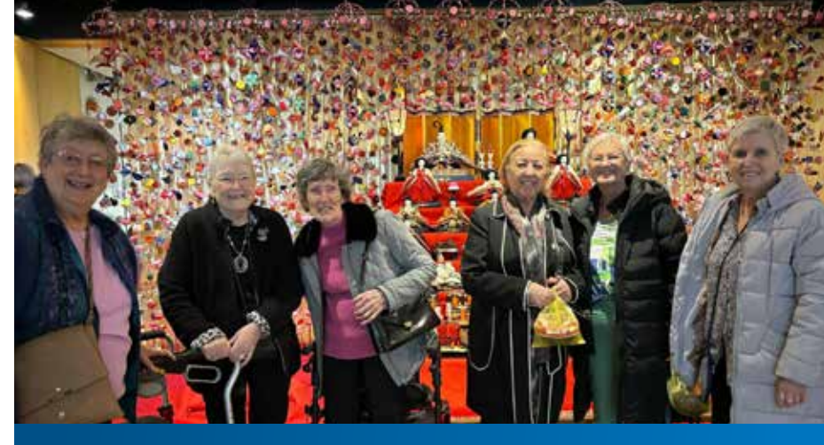
Community Members immerse themselves in the vibrant traditions and customs of Japan at the Japanese Canadian Cultural Centre Spring Festival.