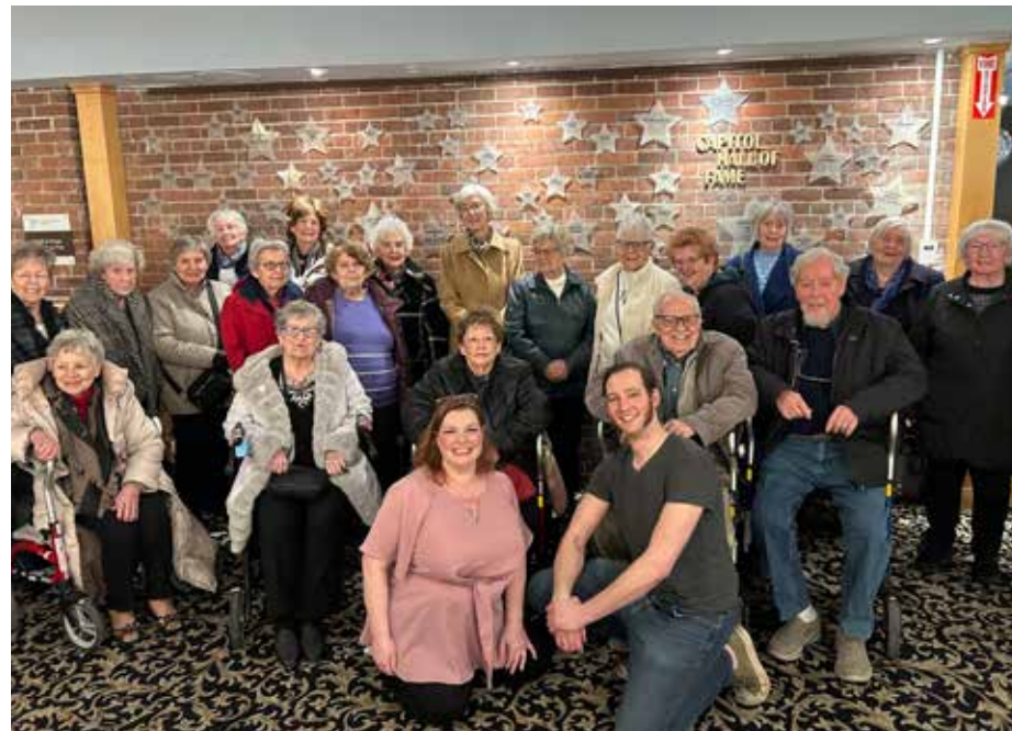
The Community Members traveled to see the play Beauty and The Beast in Port Hope.

Copyright V!VA Retirement Communities Corporation 2024