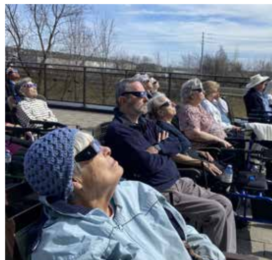
On April 8th some of our Community Members experienced a front row seat to the amazing Solar Eclipse event.