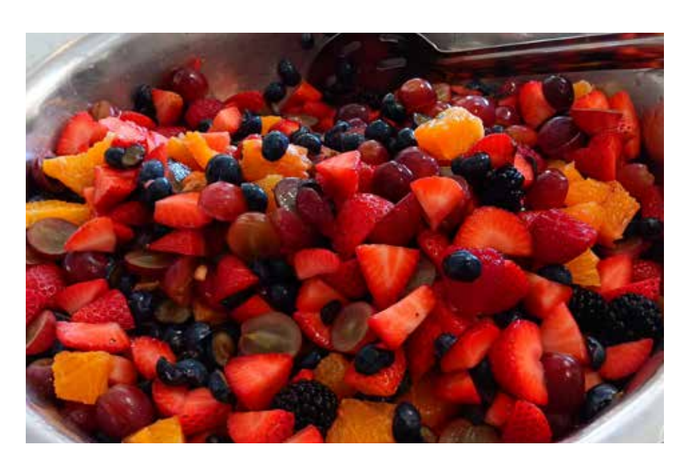
Fresh fruit salad served at the Spring Kick off party.