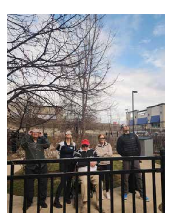
Watching the solar eclipse... with eye protection of course.