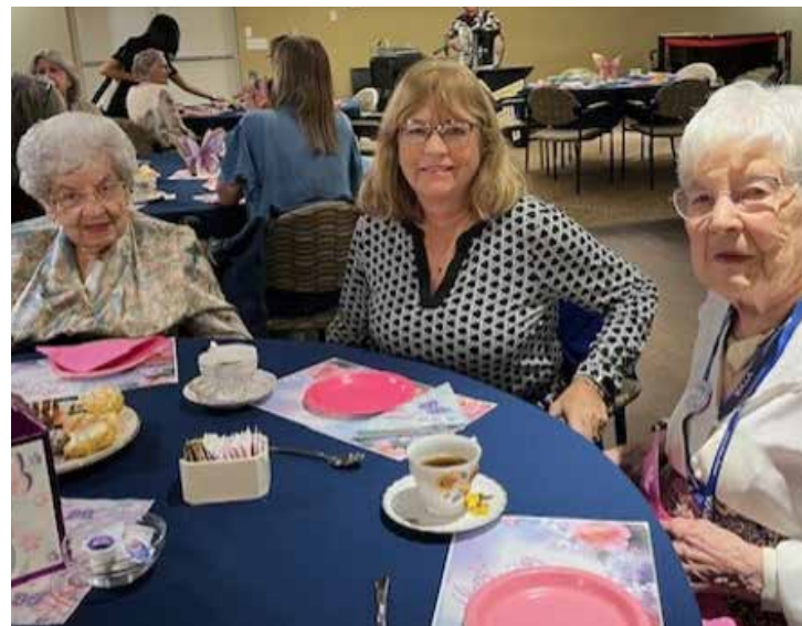
Tea, treats, and cherished moments, celebrating the extraordinary women who shape our lives, at our annual Mother's Day Tea.