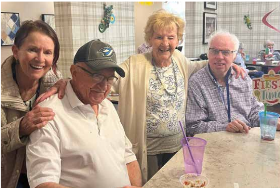
Cinco Cheers: Raise a glass to fiesta flavors and festive fun at our Cinco de Mayo pub event!