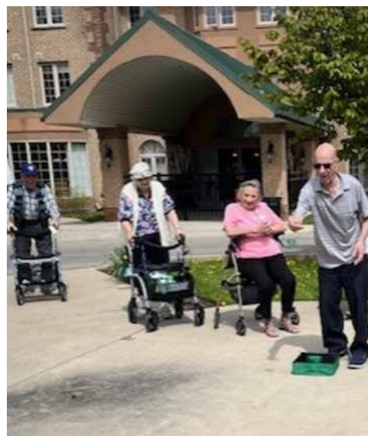
Fair Weather Washer toss - featuring the great outdoors.